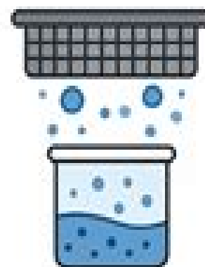
Sieving and Sedimentation