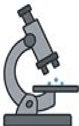
Optical and Electron Microscopy