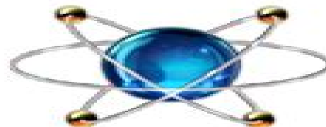
Figure 2 : Proteus Software

Proteus is a software tool set that is mostly used to automate electrical design.. Electronic design experts and technicians use the software to develop schematics and electronic prints for printed circuit board manufacture.