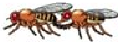
D Male licking