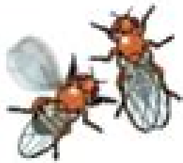
B Male song