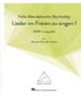
Felix Mendelssohn Bartholdy Lieder im Freien zu singen Vol. 1 HL00373821