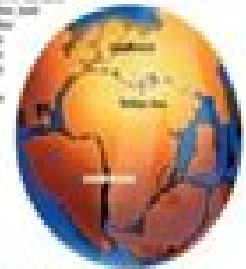
2 300 MILLION YEARS AGO The plates had nearly split. Pangea, including two continents, formed in Gondwana and Laurasia.