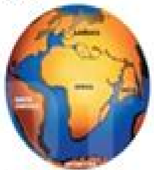
3 200 MILLION YEARS AGO Continents split, forming Africa and North America as the Atlantic Ocean basin formed.