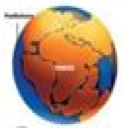
1 400 MILLION YEARS AGO The supercontinent Gondwana formed as continents merged together.

The flow of the continents, which are part of tectonic plates that drift across the Earth's surface at the rate of a fingernail's growth, has taken place over 400 million years. Africa, Australia, and Antarctica were part of the supercontinent Gondwana. When tectonic plates are pushed together, they can push together and submerge one under the other, creating a rift basin. The rift basin deepens and can eventually fill with water, forming a sea that eventually becomes the Atlantic Ocean basin. When plates slide past one another, a transform fault can form. When plates slide toward one another, a subduction zone can form. When plates slide away from one another, a mid-ocean ridge can form. The plates are constantly moving, changing at the rate of centimeters.