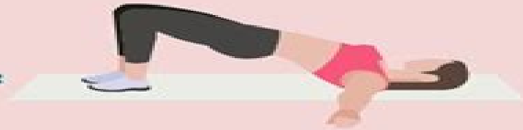
2. PILATES BRIDGE