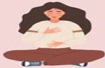
1. WARM-UP: PILATES BREATHING