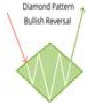
Diamond Pattern Bullish Reversal