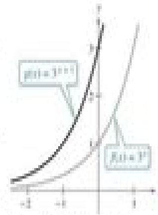
Figure 3.3 Horizontal shift