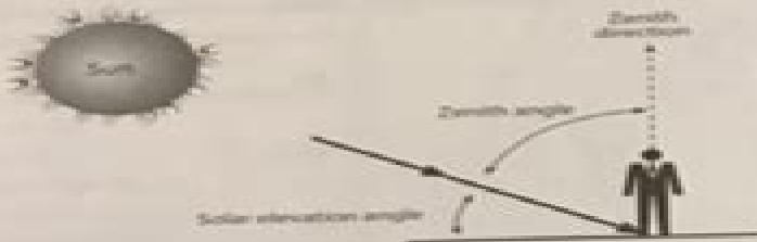
Figure 2-5. Defining angles.

Since we can assume that the Sun's rays strike Earth in straight, parallel paths, we see that the zenith angle of any location is the same as the number of degrees separating the location and the place receiving direct solar rays. Notice in Figure 2-6 that the zenith angle A at 40^\circ N is the same as the latitude difference between 40^\circ N and the subsolar point (where the Sun's rays strike directly — 23.5^\circ S here).