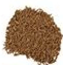
(B) Cumin seeds "Cuminiun cynimum"