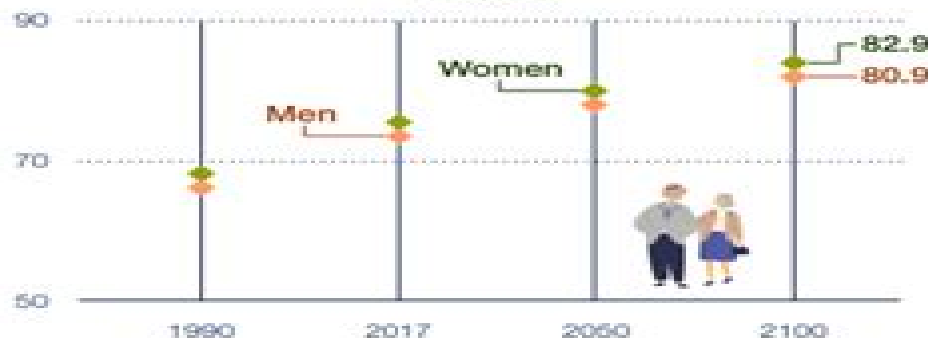
Life expectancy (in years)