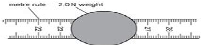
Fig. 1.2 (not to scale)