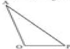
diagram not to scale